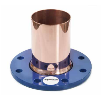
Copamate Flange Adaptor Press Fit