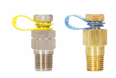
Water and Gas Test Plugs