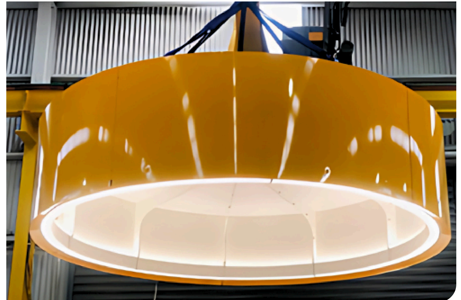
Flat Disk Light - Metro Tunnel Light Fittings