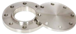
Stainless Steel Flanges