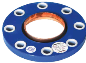
Copamate Flange Adaptors Buried Service