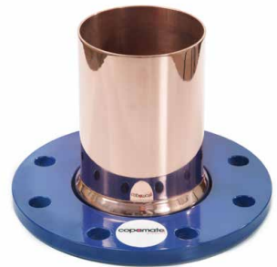
Copamate Flange Adaptor Press Fit