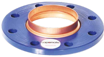
Copamate Flange Adaptors Female Socket