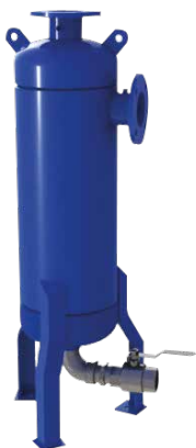
Centrifugal Solids Separators