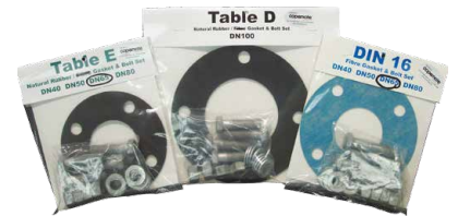
Gasket and Bolt Kits