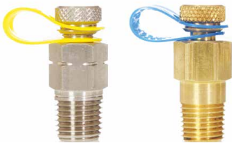
Water and Gas Test Plugs